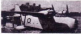
THE SARD LERWICK FLYING-BOAT