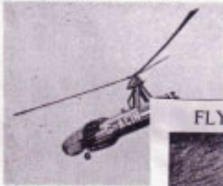
THE AUTOGIRO, A ROTATING-V