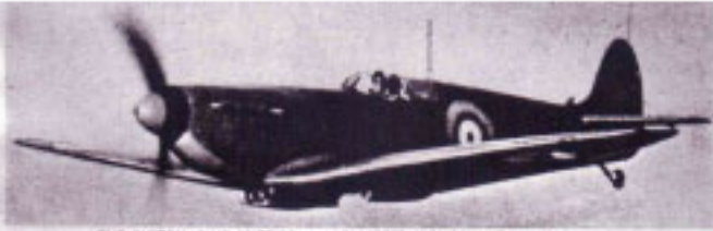
THE SUPERMARINE SPITFIRE, A HIGH-SPEED MONOPLANE WHICH HAS A 1,600 H.P. ROLLS ROYCE MERLIN ENGINE.